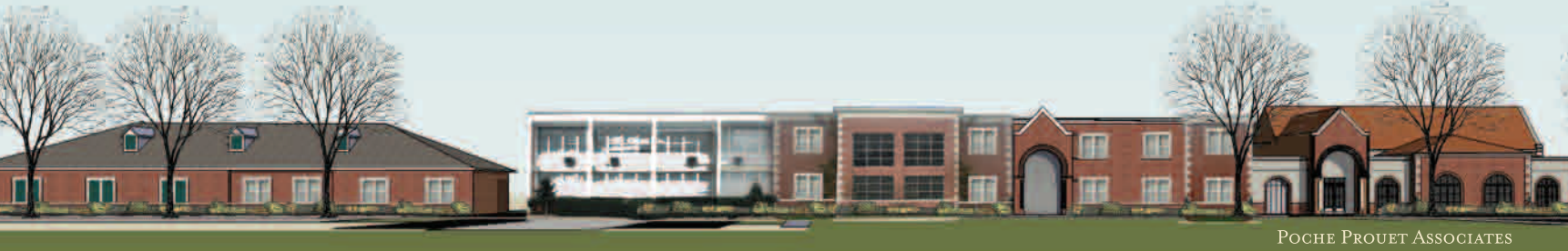
POCHE PROUET ASSOCIATES

CATHEDRAL HALL ADMINISTRATIVE OFFICES/MEETING FACILITY